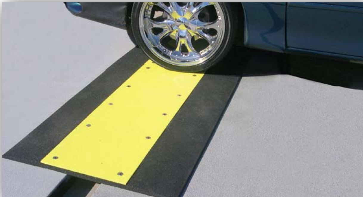
Seismic Transition Cover – Top View